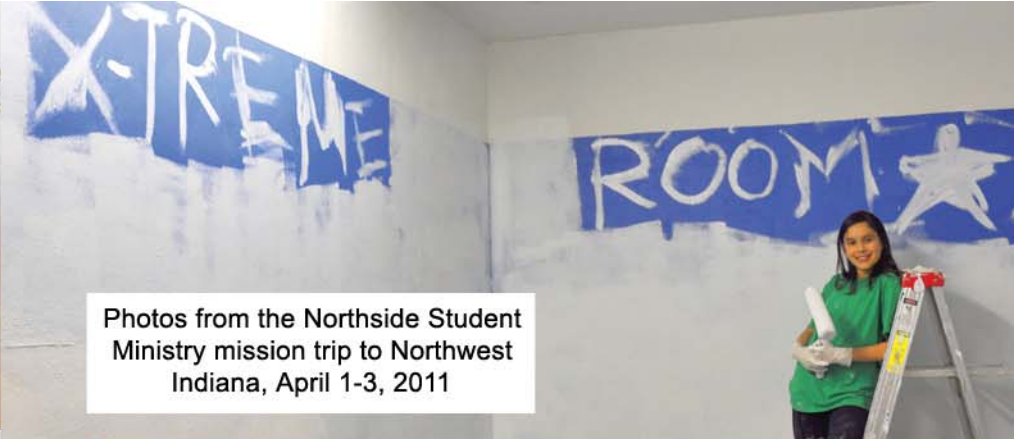
Photos from the Northside Student Ministry mission trip to Northwest Indiana, April 1-3, 2011