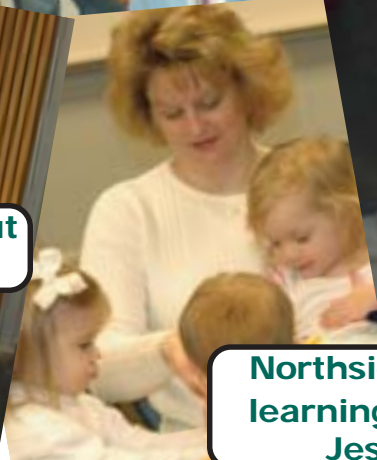
Northside Kids learning about Jesus