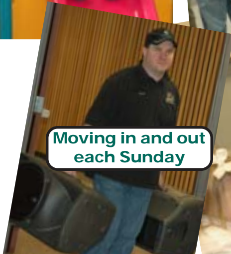
Moving in and out each Sunday