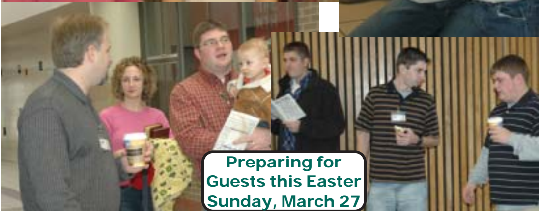
Preparing for Guests this Easter Sunday, March 27