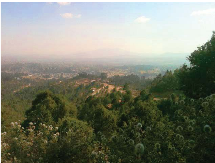
One of the beautiful views of Ethiopia. A reminder that our Creator is ultimately in control.