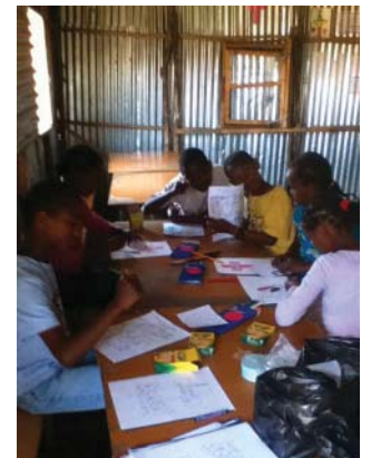
Kids at Hope for the Hopeless country orphanage enjoying crafts and sharing their stories