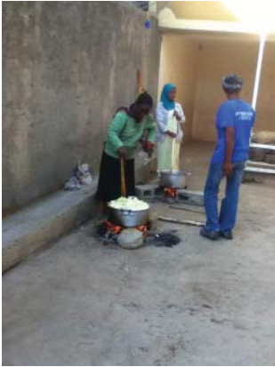
Ladies in the courtyard preparing lunch for CFI Family Day.