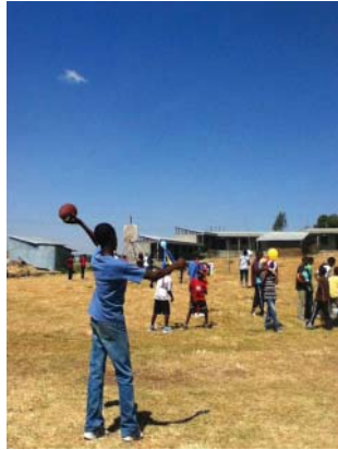
Sports equipment our team brought over for the orphanage.