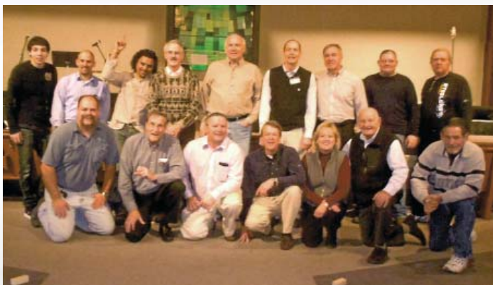
The Pew Crew: A big Thank You! goes out to the many volunteers who have helped our recent improvement projects go smoothly. The team pictured above helped move all the pews in the auditorium so the new flooring could be installed.