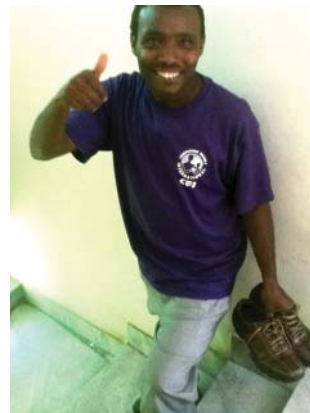
One of our translators from CFI appreciating his new shoes