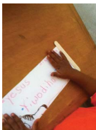
"Yesus yiwadihal" (Jesus loves you!)