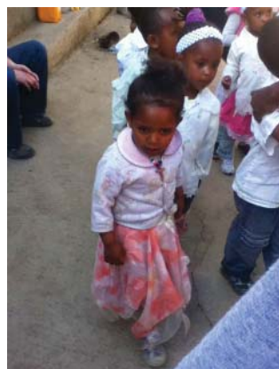
Children at CFI